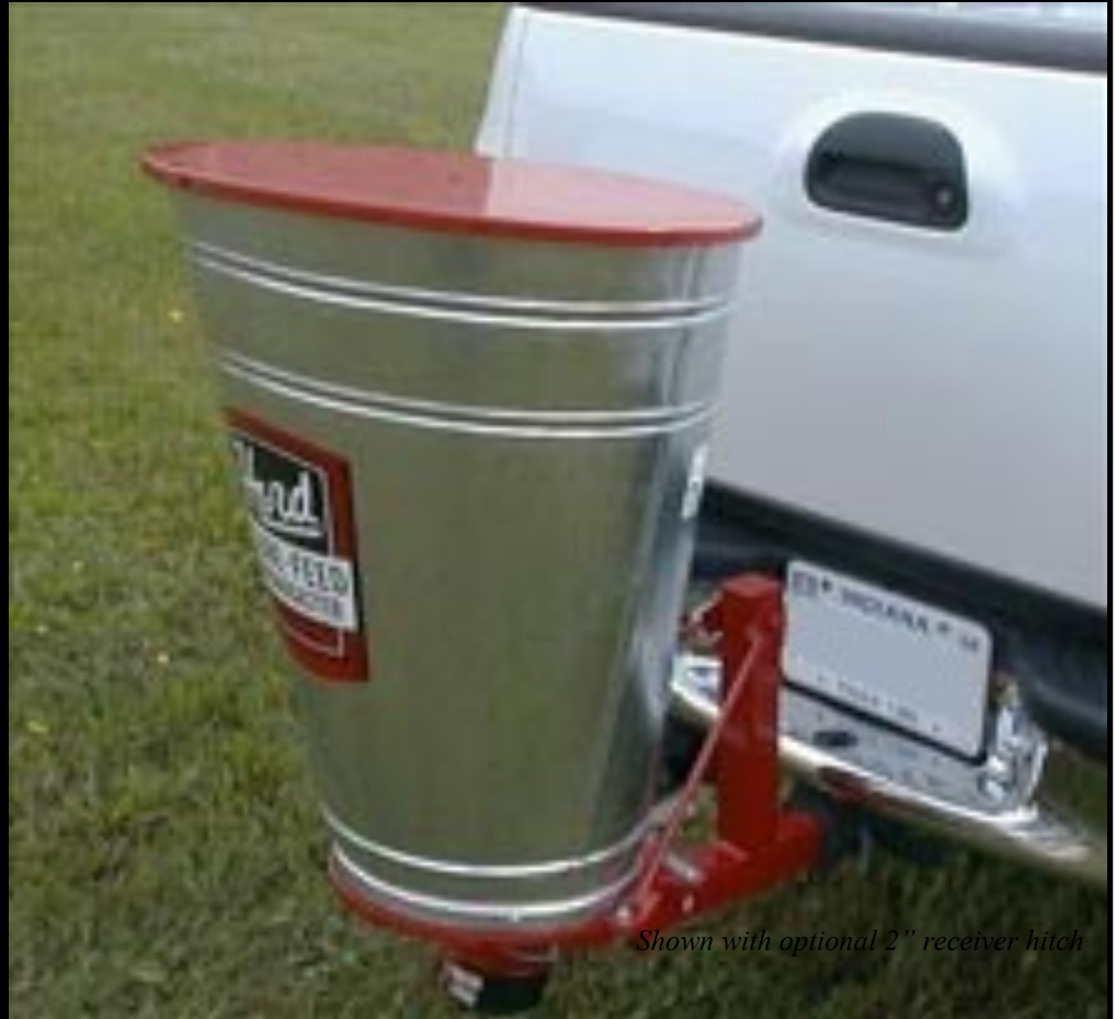
Shown with optional 2" receiver hitch

The Herd Model I-258 Broadcaster is designed to be mounted to farm tractors, pickup trucks, UTVs, or garden tractors. For mounting recommendations, please contact us. Use of this seeder with any mounting not manufactured and recommended by the factory voids warranty. Any questions about the safe operation of this broadcaster should be directed to the manufacturer.