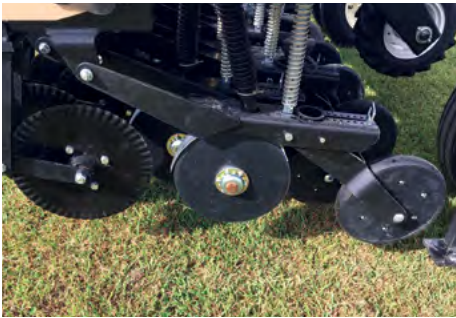
Heavy duty double disk, staggered mounting (6"), Quick T handle depth adjustment, 2 x 13 press wheels.