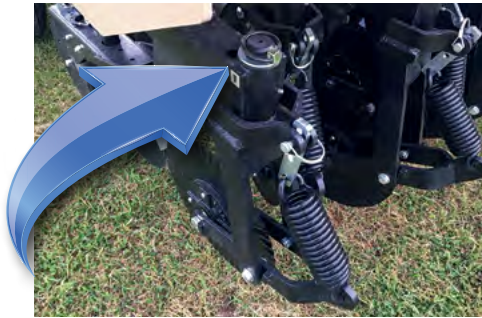
Pull this pin on each row to remove no-till coulters. This converts drill from no-till to conventional.