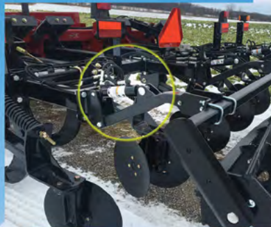
Hydraulic Roller Control Available for Tractors with Closed Hydraulic Systems

Our Tradition is Quality Driven and Field Proven