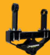
Backhoe & Excavator Pin-On Mounting Kits