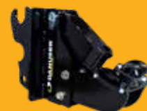
Backhoe & Excavator Quick Attach Mounting Kits