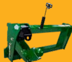
Offset Quick Attach Front-End Loader Mounts John Deere 200-500 Series (shown above), & Euro/Global