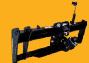
Skid-Steer / Front-End Loader Quick Attach Center & Offset

To see all mounting options, visit www.danuser.com .