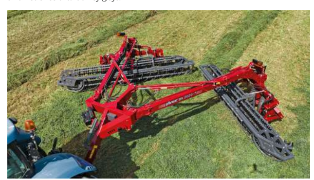
In work mode, the Basket Rake cleans the ground perfectly and reaches a width of 30 ft.