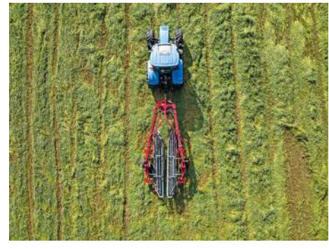
Basket\ Rake\ in\ the\ transport\ position.