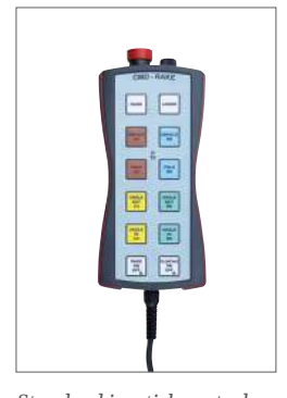
Standard joystick control.

The joystick intuitive with colored buttons that and makes the system is easy to use.