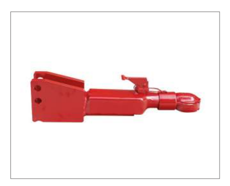
Ball hitch 2-5/16" (optional).