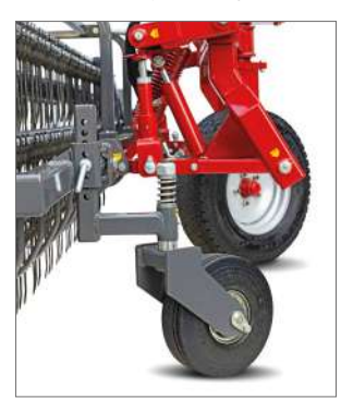
Tandem wheels and front and rear Castor wheels (standard).