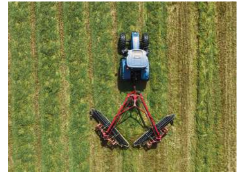
Basket Rake in the work position.