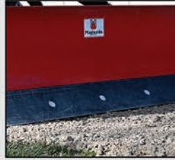
Two Hardened Steel Reversible Cutting Edges