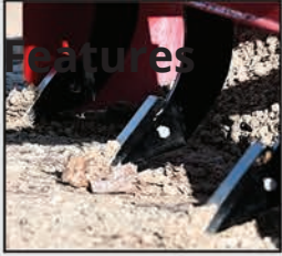
Adjustable Steel Digging Shanks with Replaceable Teeth