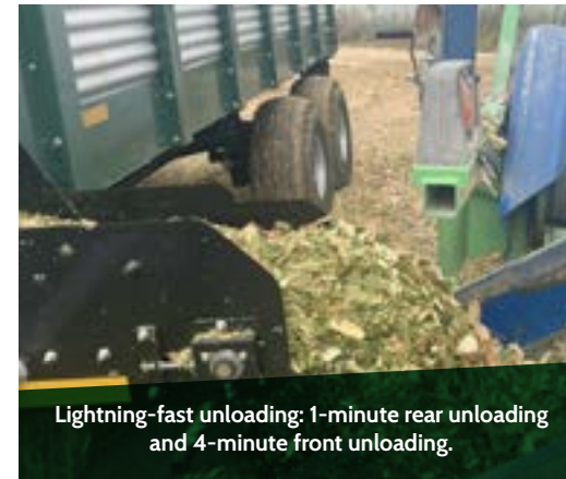
Lightning-fast unloading: 1-minute rear unloading and 4-minute front unloading.

Are you a mid-sized operation looking for a straightforward, no-fuss forage box? The Art's Way 2100 Series forage box was built to speed up unload times with a fast, hydraulic drive system which allows you to switch from front unload to rear unload with the push of a button right from the cab. We believe a quality forage box doesn't have to be loaded with unnecessary bells and whistles to get the job done. What you need is a low-maintenance forage box with durable components and the ultimate versatility with running gear and truck-mount compatible frame. This simple, serviceable and affordable forage box will keep your cow candy rolling for years to come.