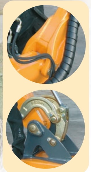
Drop forged arm brackets and flail head linkage.